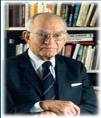
Senator J. William Fulbright