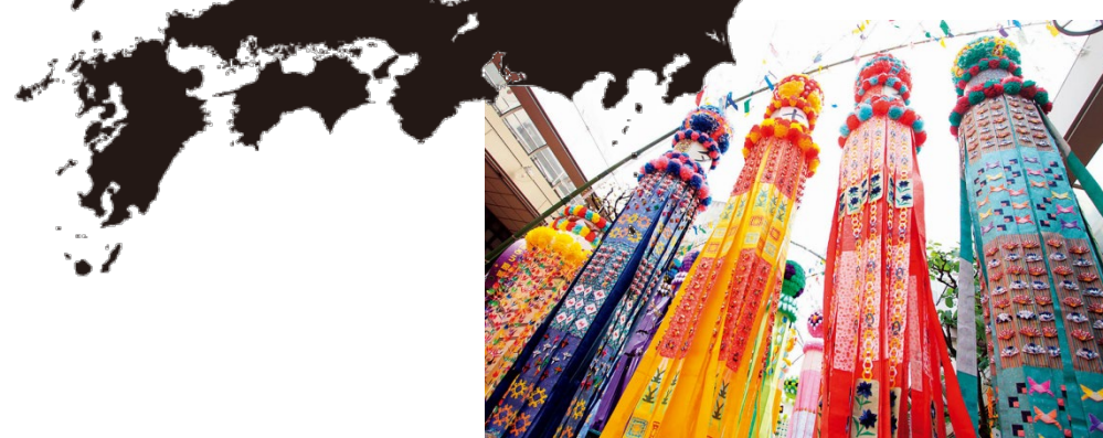
Sendai Tanabata Festival: August 6 th – 8 th

Since its founding in 1907, Tohoku University has engaged in world's top class education and research activities. Sendai city, where Tohoku University is located, has many cultural sites where you have the chance to extensively experience Japanese culture.