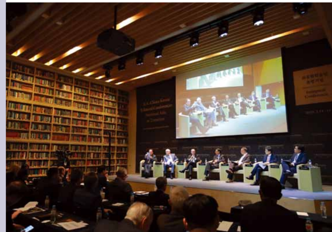
ROK-US-China Trilateral Conference

The Chey Institute supports the following international academic exchange programs.