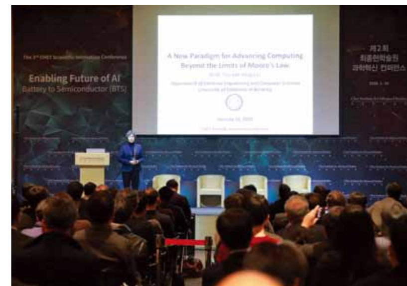
Scientific Innovation Conference