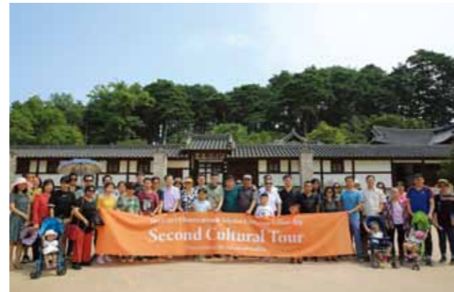
ISEF Cultural Tour

Asia Research Center 144 Xuan Thuy Road, Cau Giay District, Hanoi, Vietnam T. 84-24-3754-7670 (ext. 723) E. arc@vnu.edu.vn