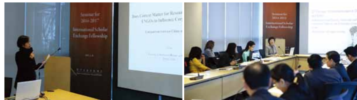
ISEF Academic Seminars