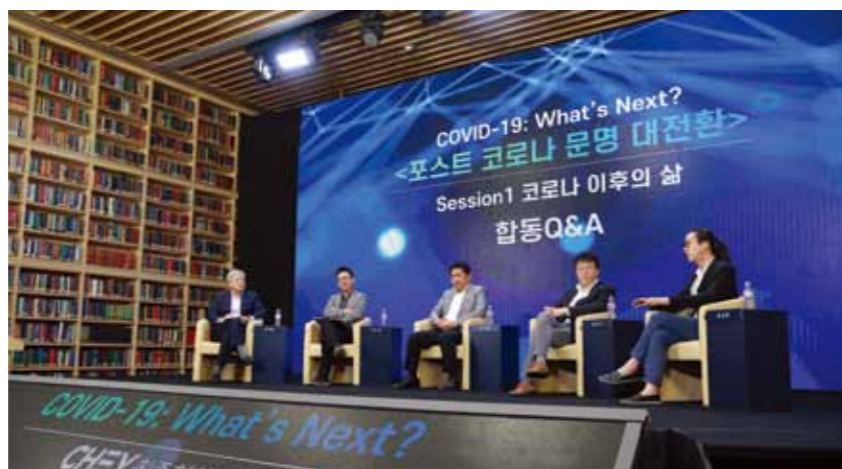
COVID19 Special Webinar Series