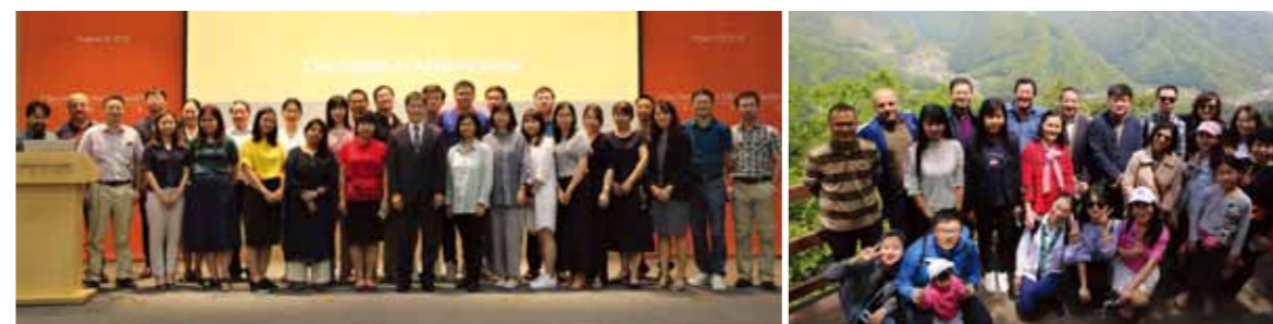
ISEF Farewell Ceremony