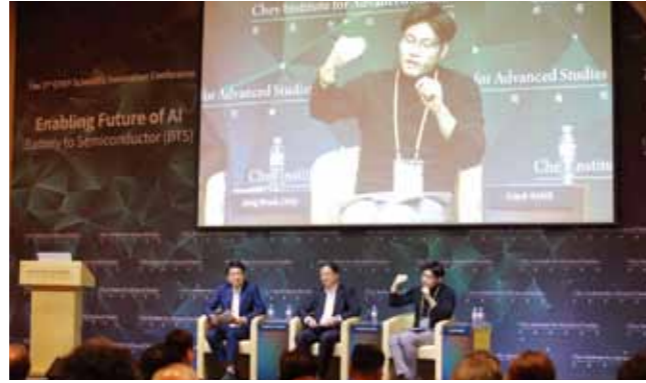
Scientific Innovation Conference